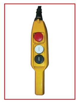
Pendant remote as standard