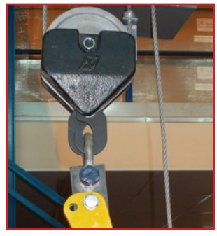
Optional 1000kg sheave kit