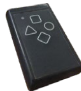
Optional radio remote control