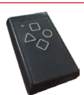
Optional radio remote control

N.B: Capacities reduced for vertical lifting, please contact our technical team for further information.