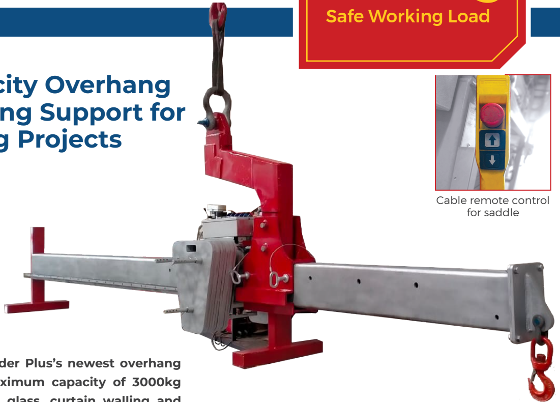
Cable remote control for saddle

The Libro 3000 is Spider Plus's newest overhang beam boasting a maximum capacity of 3000kg and is able to install glass, curtain walling and cladding below overhangs of up to 3500mm deep.