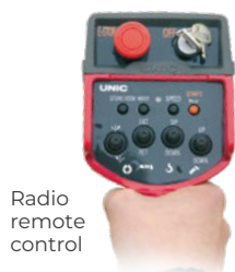
Radio remote control