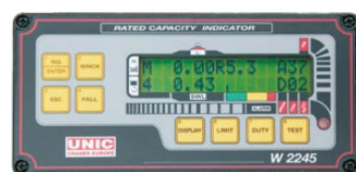
Full safe load indicator