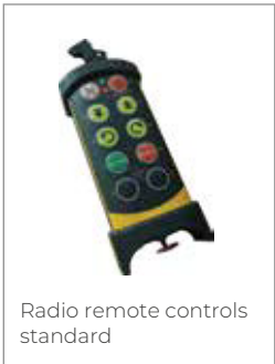
Radio remote controls standard