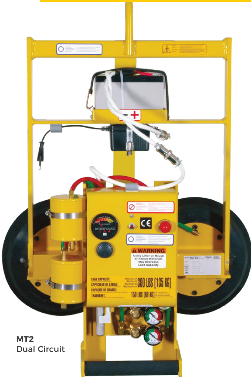
MT2 Dual Circuit