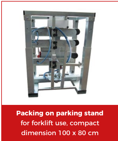
Packing on parking stand for forklift use, compact dimension 100 x 80 cm