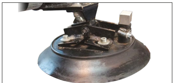
Flexible pads and swivel arms to attach to convex or concave loads