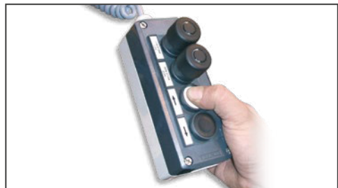
Cable remote control as standard