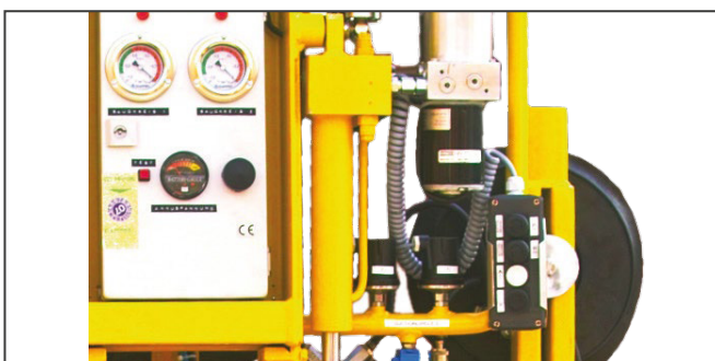
Powered hydraulic tilt system