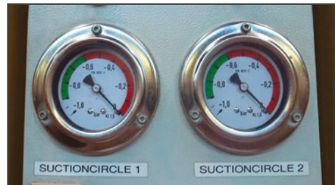
Dual circuit vacuum system