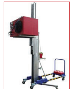
Optional Fork Attachment 560mm (W) x 700mm (L)