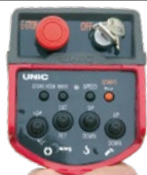
Standard radio remote control