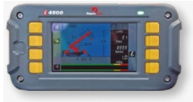
Safe load indicator