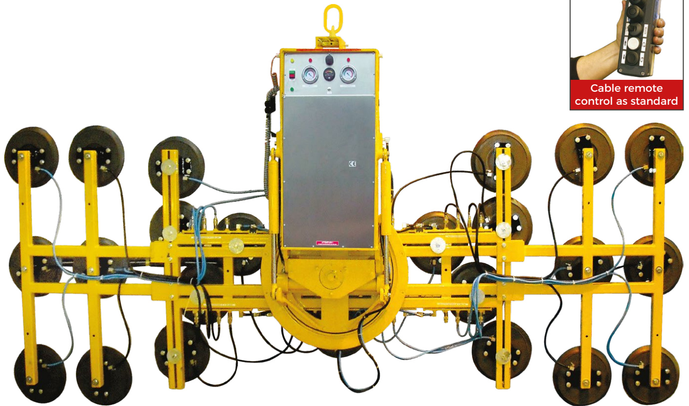
Cable remote control as standard