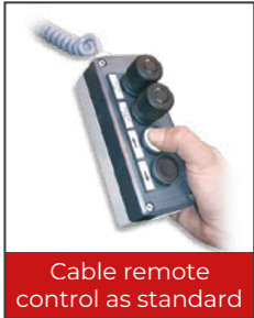
Cable remote control as standard